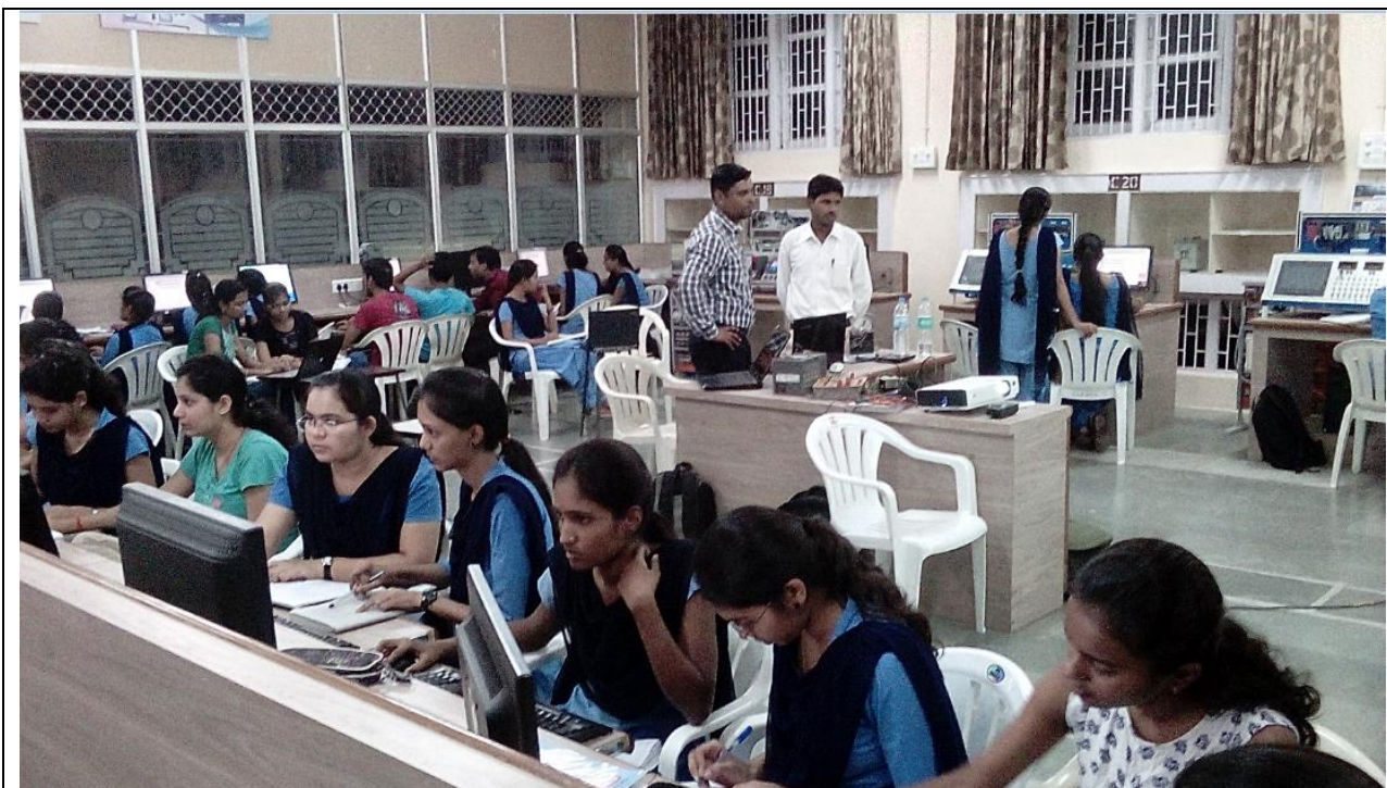
One week training program on PLC and Automation during 25 th July 2017 to 3 rd August 2017