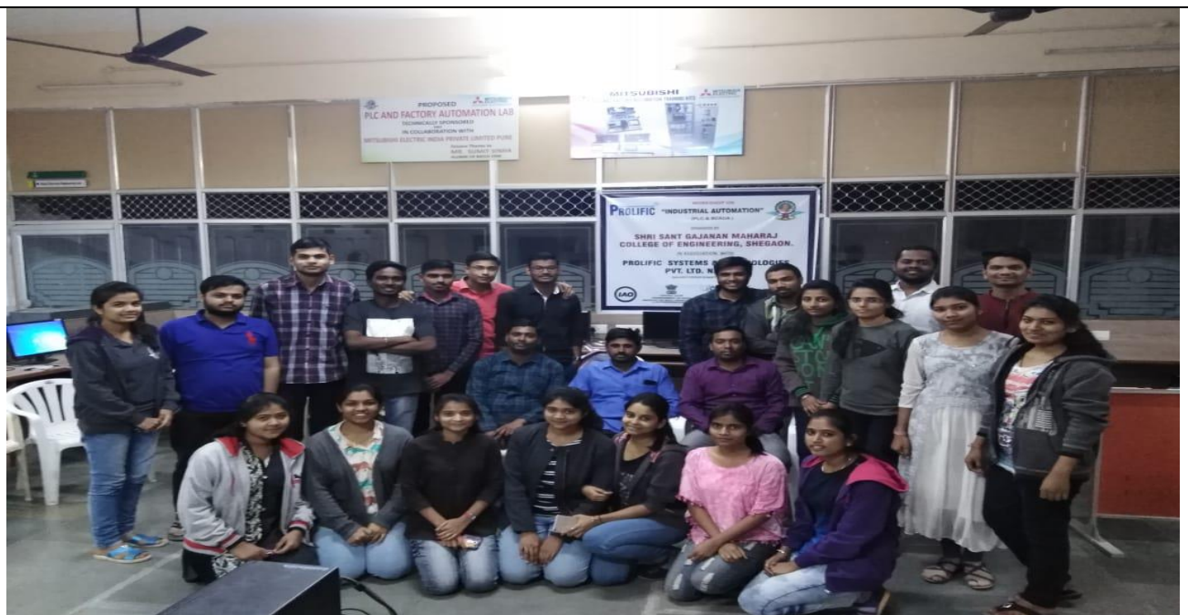
One week training program on PLC and Automation during 8 th August 2018 to 17 th August 2018