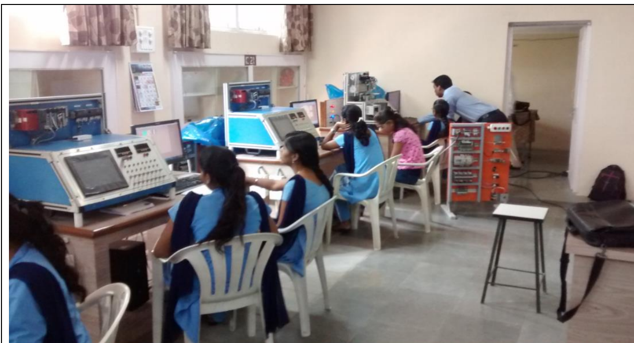
One week training program on PLC and Automation during 9 th September 2017 to 18 th September 2017